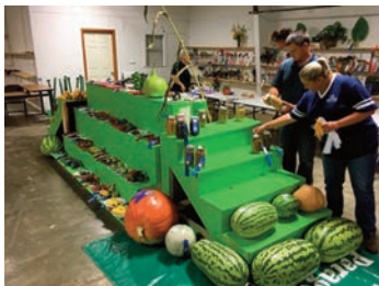
Blue ribbon winners at Greene County Fair.