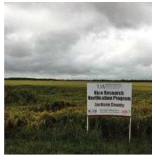
Rice demonstration field in Jackson County.

Bands of stormy weather spanning out from Hurricane Harvey in late August and early September dumped upwards of 10 inches of rainfall in some eastern Arkansas counties, impacting tens of thousands of acres of both rice and soybeans in the state.