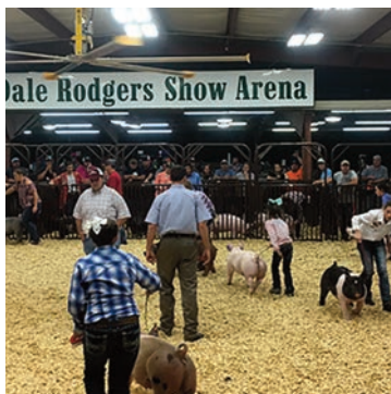
Swine judging at Polk County Fair.