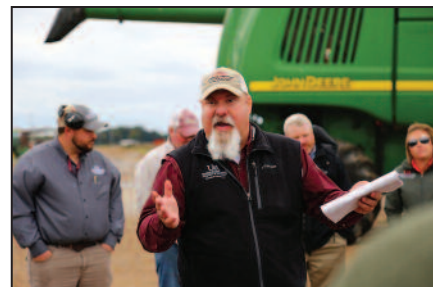
Congressional aides from the offices of several members of the Arkansas Congressional delegation tour the Hare Family Farm and the Newport Extension Center on Friday, Oct. 26.