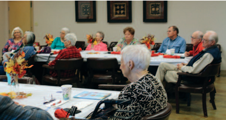
Below: Retirees at the Jonesboro meeting.