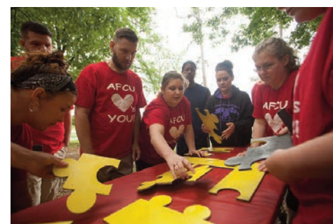
Teams compete in team building activities at the 2015 ExCEL Challenge.

“The readers of Arkansas Business magazine vote for the Best of Biz awards, and it means a lot to the 4-H Center and ExCEL program to be selected as the winner of this category,” he said. “We work with many