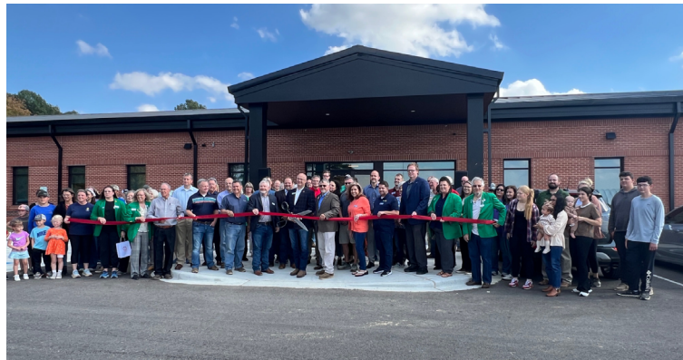
Greene County leaders and residents join Cooperative Extension Service personnel for a ribbon cutting at the new Greene County Extension Office on Oct. 29, 2024.

Several groups are already using the facility regularly. 4-H clubs, Master Gardeners, and Extension Homemakers Clubs — all outreach organizations of Extension — use the community room