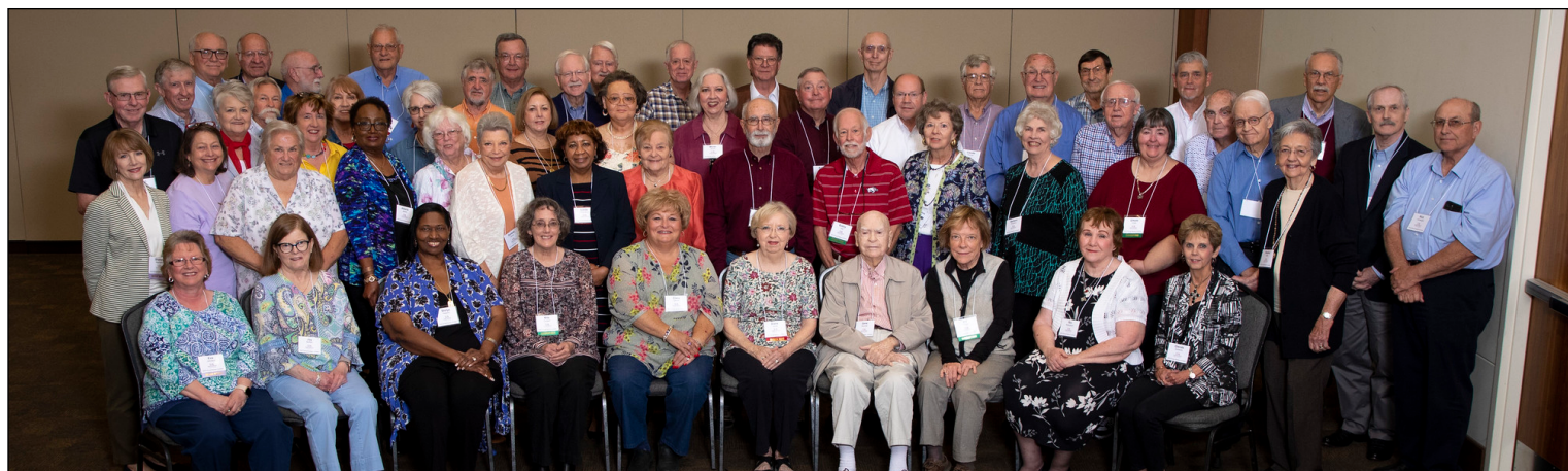
Retirees pose for a group photo at the 2022 Retiree Reception & Luncheon