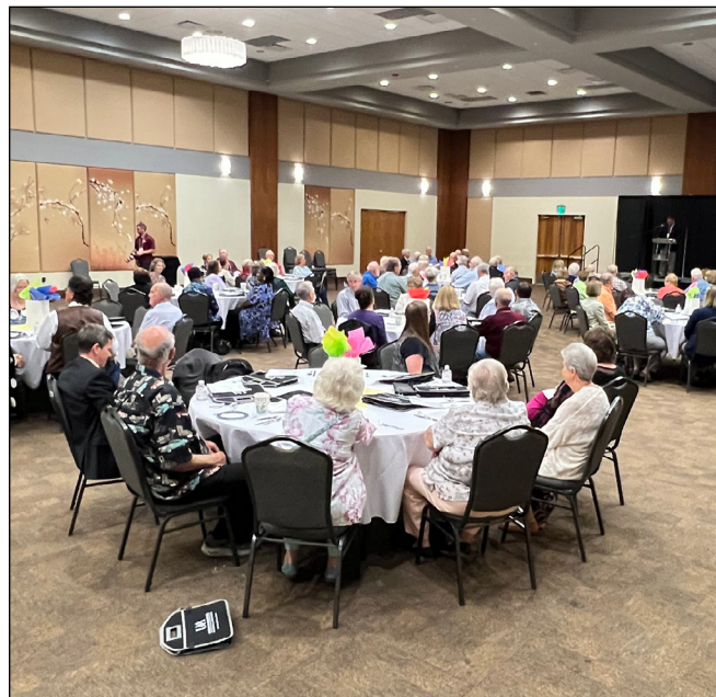
Retirees gather at the Benton Event Center.