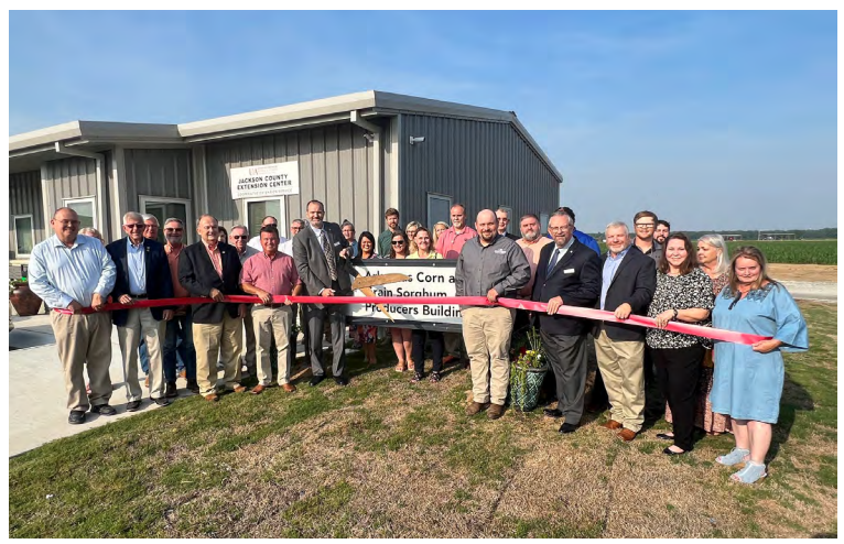
Extension personnel and guests cut a ribbon to celebrate the opening of the Arkansas Corn and Grain Sorghum Producers Building at the Jackson County Extension Center in Newport on June 9, 2023.

Arkansas is ranked No. 17 in the nation in corn for grain production. Corn generates about $516 million in cash receipts each year in Arkansas, according to