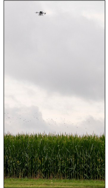
Collaborative research across many states within the Association of Public and Land-Grant Universities has helped adapt drone technology as an agricultural tool.