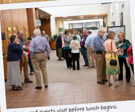
Retirees and guests visit before lunch begins.