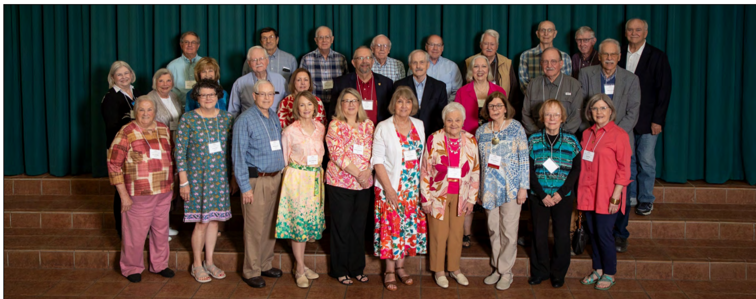
Retirees pose for a group photo at the 2026 Retiree Reception & Luncheon.