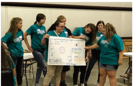
The "blue" personality group explains their design for the perfect school

second evening, commented at the conclusion of the first night: "I will be back tomorrow night. This is wonderful information, and I do not want to miss the rest of the program." At the request of participants, the possibility of a third session is being discussed.