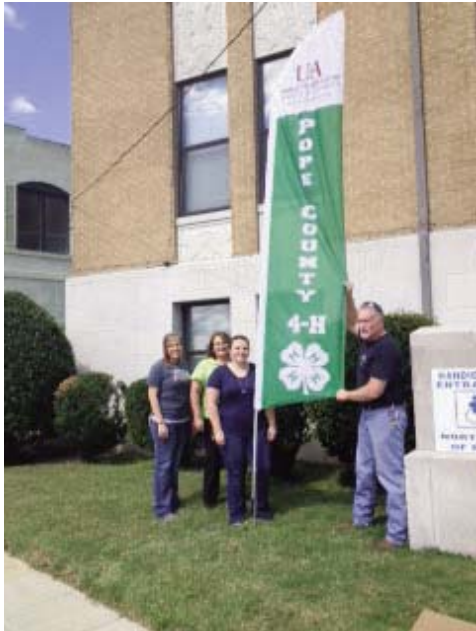
POPE COUNTY 4-H'ERS GIVE BACK – Pope County 4-H promoted the month of service by displaying three flags around the Pope County Courthouse during the month of October. The flags stand 11 feet tall and were sure to be seen by anyone who drove by. The county also participated in a canned food drive where they collected over 400 items to be donated to the Main Street Mission in Russellville. This is just one of the many ways that Pope County 4-H members dedicated their “hands to larger service.”