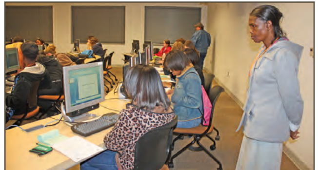
Advanced campers develop presentations to pitch their business idea.