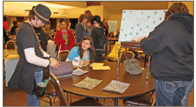
Campers buy and sell their products at market.