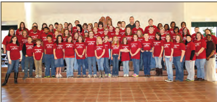
2012 Entrepreneur Camp participants.