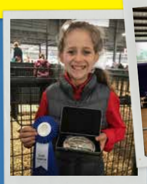
Swine Junior Winner

Skillathons were held during the Arkansas State Fair to test exhibitors' knowledge. In the Sheep, Beef, Goat, and Swine Skillathons, participants were divided into junior or senior age divisions. In each division, participants were required to complete a quiz, identify breeds, identify feeds, junior identified animal body parts, seniors completed a quality assurance activity, identify retail or wholesale meat cuts, and identify equipment. The top three winners received a ribbon and prize money and the winners received belt buckles.