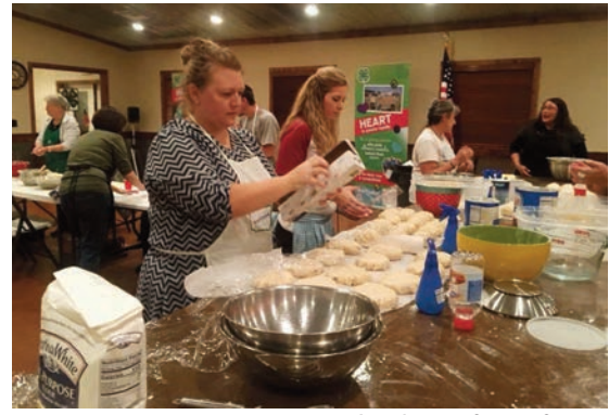
Participants prepare pie crusts in batches to freeze for winter meals

The Polk County Extension Homemakers recently formed a new club focused on preserving home skills. In November, members and potential members gathered for a pie crust workshop where all participants made a bulk pie crust recipe. The recipe produced approximately 20 pie crusts per batch that participants could freeze and use to prepare meals for the holidays. An educational handout, Sweet or Savory?, provided some savory recipes participants could use for pot pies and quiches that make inexpensive meals for the holiday season.