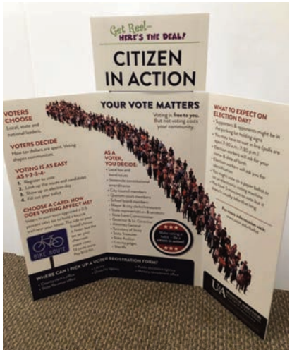
Citizen in Action display.