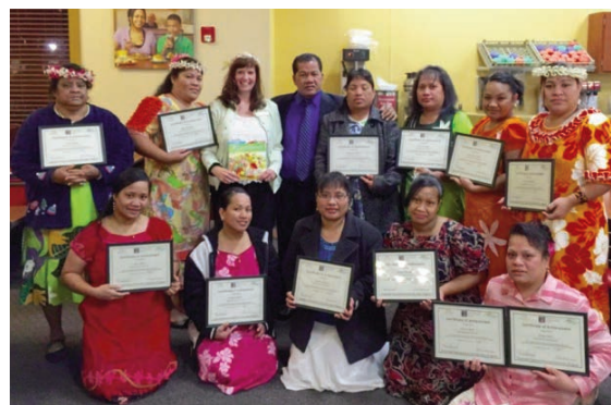
Marshallese participants receive diplomas on completing EFNEP Eating Smart-Being Active classes.

There are an estimated 10,000 to 12,000 Marshallese living in Northwest Arkansas communities. The Washington and Benton County EFNEP programs partnered with the University of Arkansas for Medical Sciences’ (UAMS) northwest campus in Fayetteville in 2015 to encourage healthy eating and physical activity for Marshallese families.