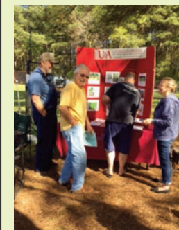
Educational exhibit at homesteading conference.