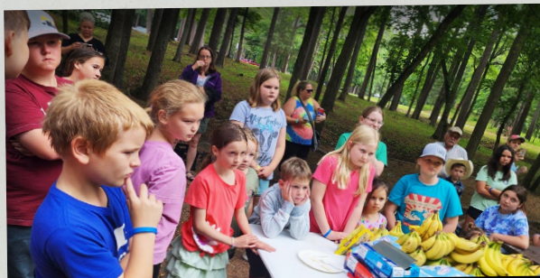
Members who attended the 4-H Blanchard Springs Outdoor Day take a break from action for lunch.