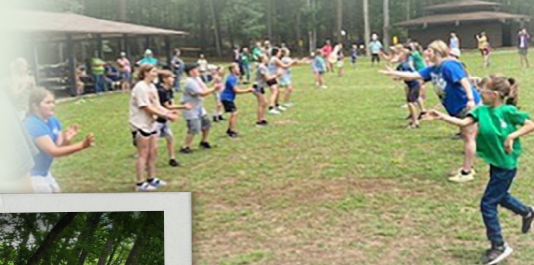
4-H members enjoy a water balloon fight.

Nine counties teamed up to host 4-H Blanchard Springs Outdoor Day on June 12 with more than 123 4-H members, adults and agents attending from Stone, Izard, Baxter, Independence, Searcy, Cleburne, Marion, Van Buren and Sharp counties. 4-H member learned safe blade handling/knife skills, campfire cooking and proper tent set up, and created crafts with outdoor materials. After the educational sessions, 4-H members enjoyed lunch and a water balloon fight before exploring the surrounding areas. ■