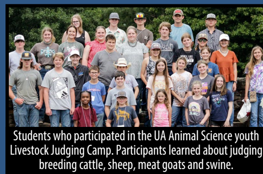
Students who participated in the UA Animal Science youth Livestock Judging Camp. Participants learned about judging breeding cattle, sheep, meat goats and swine.