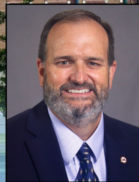
FROM THE DIRECTOR