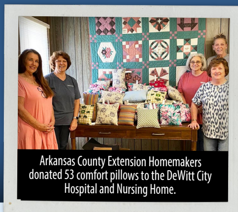
Arkansas County Extension Homemakers donated 53 comfort pillows to the DeWitt City Hospital and Nursing Home.

Members of the Arkansas County Extension Homemakers have made it their mission to help others. Recently, they enjoyed a day of fellowship, fun, food at the Arkansas County Cooperative Extension, where they donated their time and talent cutting material, sewing and delivering 53 comfort pillows to the DeWitt City Hospital and Nursing Home. The pillows are made of machine-washable fabric and stuffed with fiberfill for easy care. It's just a little thing, but it can remind others that someone cares! ■