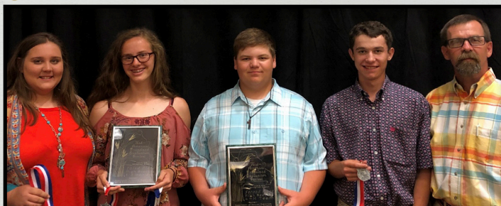
Randolph County 4-H team – Second place 4-H team and 3rd high individual at the Mid-America Grassland Evaluation Contest.