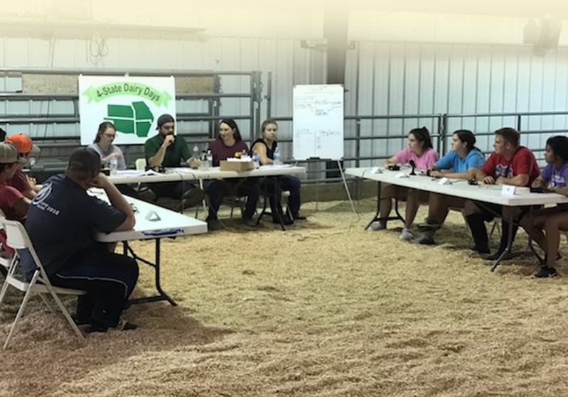
Animal Science graduate students ask questions of quiz bowl contestants.

The 4-State Dairy Days event is hosted by the Benton County Dairy Industry Association. ■