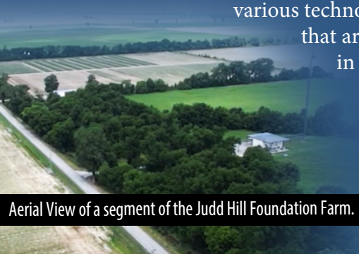
Aerial View of a segment of the Judd Hill Foundation Farm.