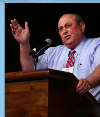
FROM THE DIRECTOR