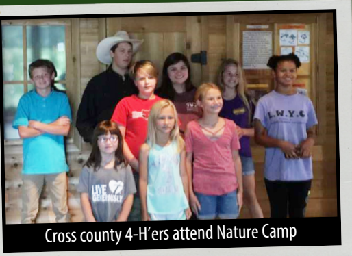
Cross county 4-H'ers attend Nature Camp