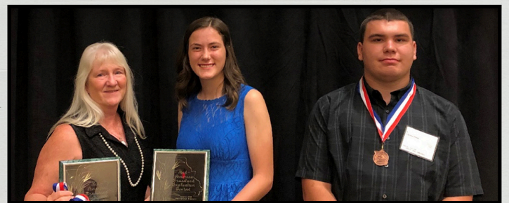
Madison County 4-H team – Third place 4-H team and 5th high individual at the Mid-America Grassland Evaluation Contest.