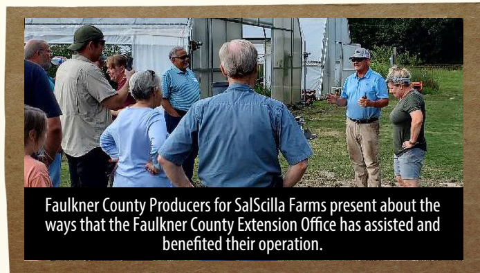
Faulkner County Producers for SalScilla Farms present about the ways that the Faulkner County Extension Office has assisted and benefited their operation.