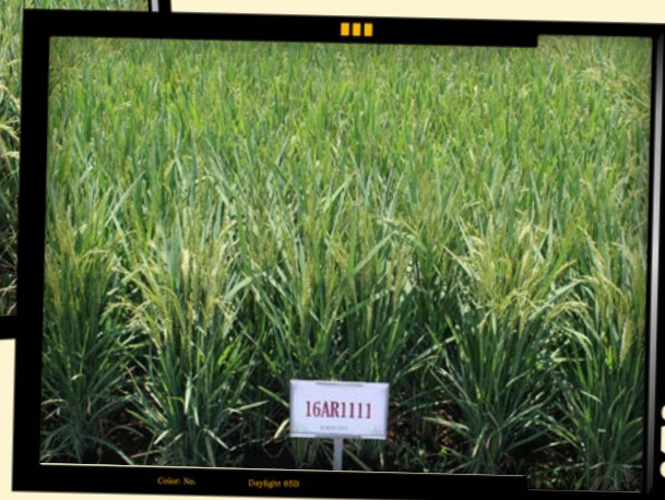
(Pictured L-R) CLM04 (16AR1030) and CLL15 (16AR1111) are two new and exciting Clearfield® rice varieties.