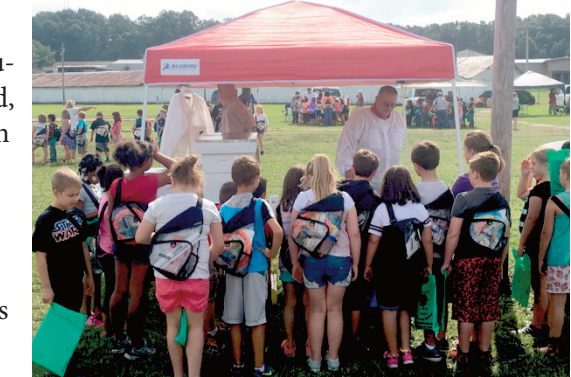
Northeast Arkansas Beekeepers taught first through third grade students about the importance of bees.

faculty and parents from Harrisburg, Tyronza and Weiner elementary schools experienced interactive sessions, such as the Farm Bureau dairy cow, combine simulator and cotton gin, in addition to honey bees, water conservation, commodities, composting, animal discovery zone, nutrition,