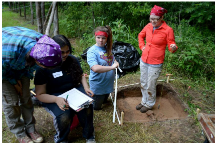
4-H youth work one-on-one with professional archeologists conducting an investigation of an 1840s plantation home in Winchester, Arkansas.

An impact of $39,149.79 from the 1,697 documented volunteer hours in 2016 is the reward reaped by Prescott and Nevada County.