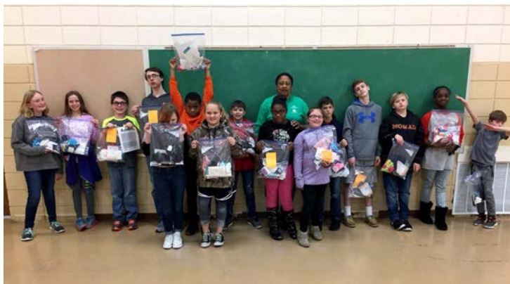
Drew County 4-H'ers get ready to distribute personal care bags for the homeless.

A H.U.G. S. (hats, underwear, gloves and socks) banquet is held at the end of each year. The proceeds are usually donated to the local Head Start programs and Adult Housing Authority, but this year the items were used for homeless bags. In addition to the H.U.G.S. items, toothpaste, toothbrushes, water, soap, shampoo, conditioner, lotion and deodorant were included in the bags. Each student also added a nonperishable food item to the bags before dispersing them. ■