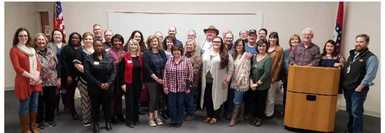
Attendees at Arkansas Agritourism Association first official meeting.

The association has created a Facebook page at https://www.facebook.com/Arkansas-Agritourism-Association-750327768403353/ . Additional information about agritourism in Arkansas is available on Extension's website at www.uaex.edu/agritourism . ■