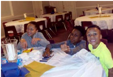
Drew County 4-H youth assembled and distributed personal care bags for the homeless.

The students were given an opportunity to share how they feel when they see a homeless person. They were given examples of how people can become homeless, some of which are: 1) inability to work due to illness; 2) loss of job; 3) domestic violence; 4) runaway teens; and 5) drug abuse. They learned that becoming homeless can happen to anybody. They were also instructed on the need to always be courteous and respectful and to treat others as they want to be treated.