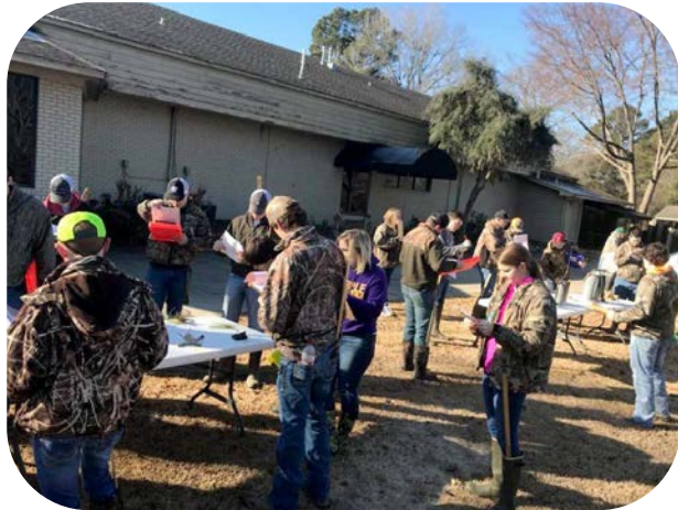
4-H and FFA youth test their forestry knowledge at the Hogskin Forestry Contest.

For the eighth year, Calhoun County 4-H hosted its annual fundraiser, the Hogskin Forestry Contest, and it did not disappoint!