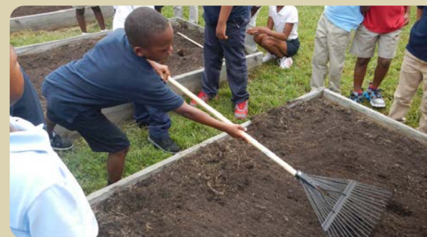
The garden at Western Hills Elementary contains 30 garden beds that must be weeded before the children can plant.

We would like to thank all those who support our work and allow us to do more and more for our community. Without the help of those at the state office and advice given from other county agents, we would not be able to do all of these programs. It is such a blessing to work with others who are so supportive and encouraging, and we would like to thank you all. ■