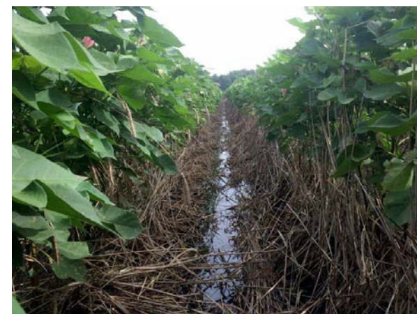
Cotton planted into a cover crop.