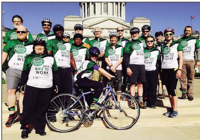
2014 Extension Bike to Work team poses on State Capitol steps.

The Bike to Work team was part of the eight-week ExtensionGetFit effort. ■