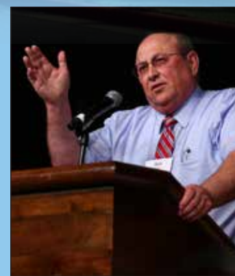
FROM THE DIRECTOR