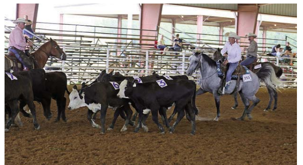
Competitor No. 253 takes part in ranch cutting class at the Arkansas 4-H state horse show.

More than 100 youths from 26 counties added up to 902 entries, making the 2014 Arkansas 4-H State Horse Show the largest in the last five years.