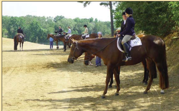
Hunter under saddle competitors await the start of their class.