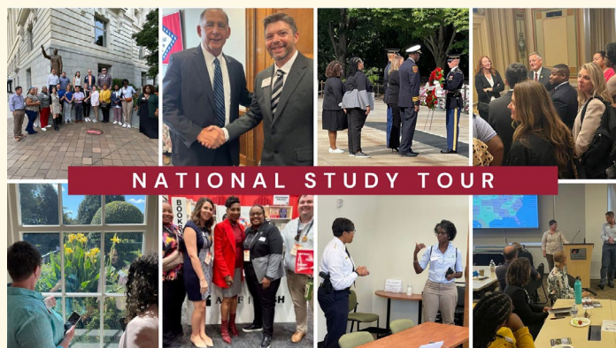
NATIONAL STUDY TOUR

With the objective of learning more about the current issues facing our nation, LeadAR Class 20 kicked off its National Studies Tour on Sept. 17, 2023. The class hit the ground running in Washington D.C. Read the blog post here . ■