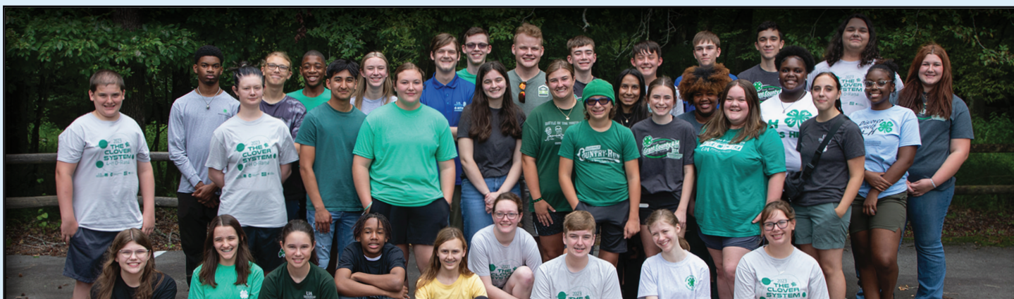
2023-2024 Tech Changemakers from Arkansas, Bradley, Clay, Cleveland, Drew, Grant, Hot Spring, Jefferson, Lonoke, Perry, Prairie, Saline, Washington, and White County are ready to help you Bridge the Digital Divide!

50+ teens spread across 20 counties in Arkansas who are providing lessons to help bridge the technical divide through education on tools to build jobs skills. The teens provide programming on Recreational Drone Licenses, Social Media, Job Searches, Resume building, and Safe Access to Internet. If you are interested in having a 4-H Tech Changemaker program in your county, please contact the Arkansas 4-H office. ■