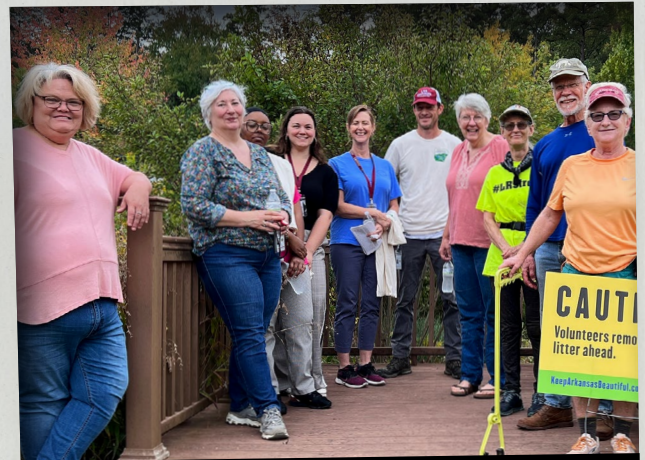
Thanks to the members of the cleanup crew. Taken at the end of the Oct. 26 Coleman Creek cleanup by extension faculty, staff and volunteers. Several members of the volunteer corps were not able to make the photo.