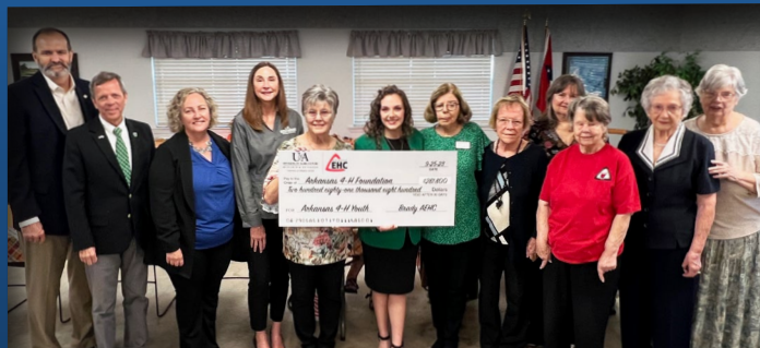
Members of the Brady EHC Club present a check Sept. 25, to Arkansas 4-H Foundation to create an endowed scholarship.