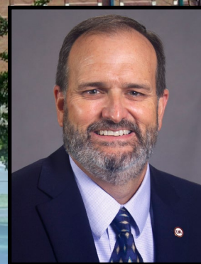
FROM THE DIRECTOR