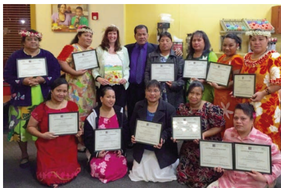
Marshallese participants receive diplomas on completing EFNEP Eating Smart-Being Active classes.

There are an estimated 10,000 to 12,000 Marshallese living in Northwest Arkansas communities. The Washington and Benton County EFNEP programs partnered with the University of Arkansas for Medical Sciences’ (UAMS) northwest campus in Fayetteville in 2015 to encourage healthy eating and physical activity for Marshallese families.