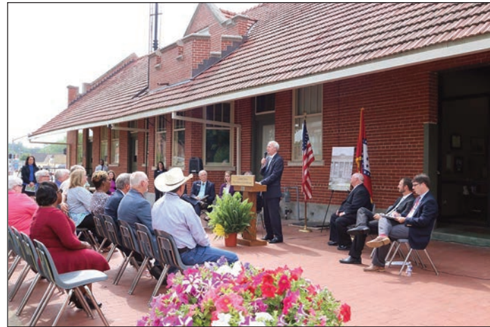
Gov. Hutchinson speaking at Kickstart Lonoke press conference.

https://kickstartlonoke.wordpress.com/actionplan/ . ■