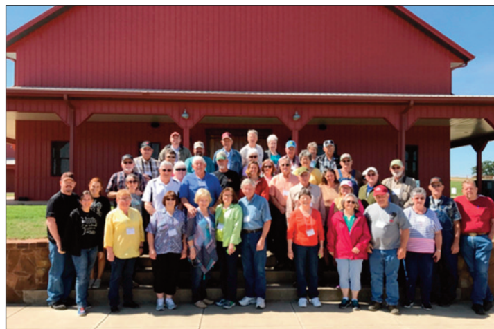
Tour participants at 44 Farms in Cameron, Texas.