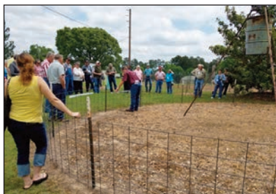
Producers learning about feral hog control research at the Overton Texas A&M Research and Extension Center.