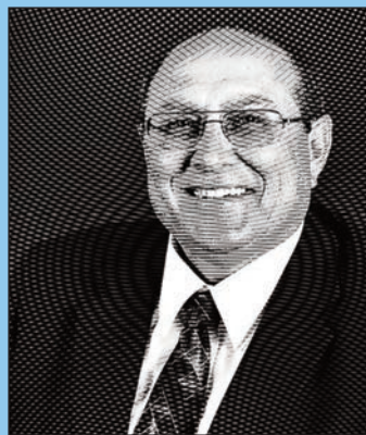
FROM THE DIRECTOR