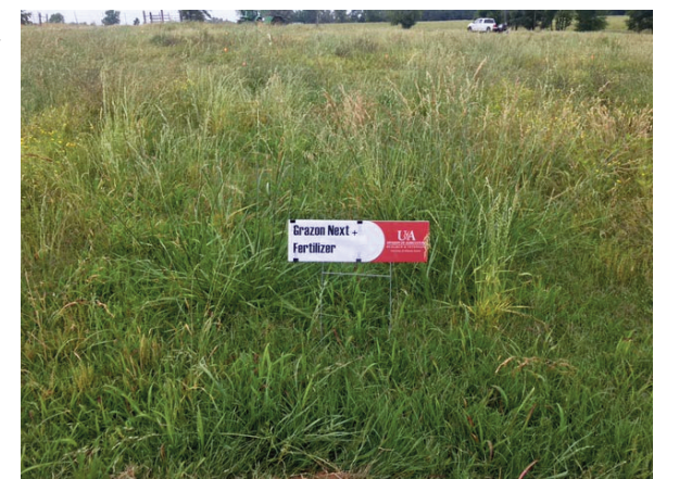
Impregnated dry fertilizer, treatment 7.