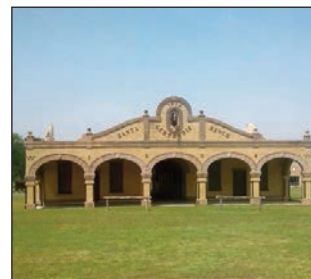
The original Livery Stable at the Historic King Ranch.