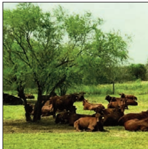
Santa Gertrudis cattle at the King Ranch where the breed originated.