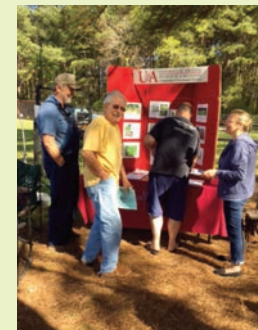
Educational exhibit at homesteading conference.