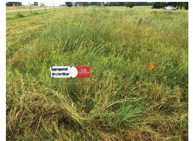
Foliage GrazonNext HL + fertilizer, treatment 4.

We hope these team efforts to improve forage and cattle production using new technology continue to gain strength. ■