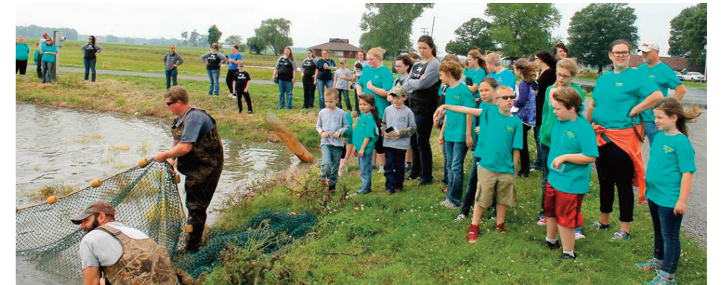
Those attending the 4-H WHEP contest learned about aquaculture at the Joe Hogan Fish Hatchery in Lonoke.