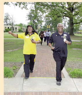
More than 160 walkers/runners participated in the 1890 Wellness Walk/Run in April.

The 1890s on the Hill Celebration, held in July in Washington, D.C., provided the nation's 1890 land-grant universities an opportunity to celebrate their anniversary milestone. The event included research exhibits, Congressional member speeches and a convocation. ■