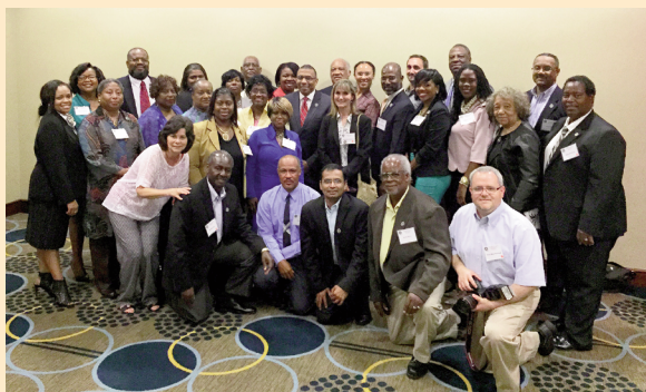
A delegation from UAPB participated recently in the 1890s on the Hill Celebration, held in Washington, D.C. in commemoration of the signing of the Second Morrill Act of 1890.