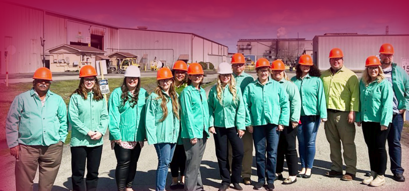
In Newport, LeadAR Class 19 toured Arkansas Steel Associates , a mill which produces specialty products for the railroad industry.

real-world challenges facing the organization by completing a leadership service project. The group met virtually on March 18 to share their leadership project plans. Here's an overview of the ideas presented. For the full article, click here . ■