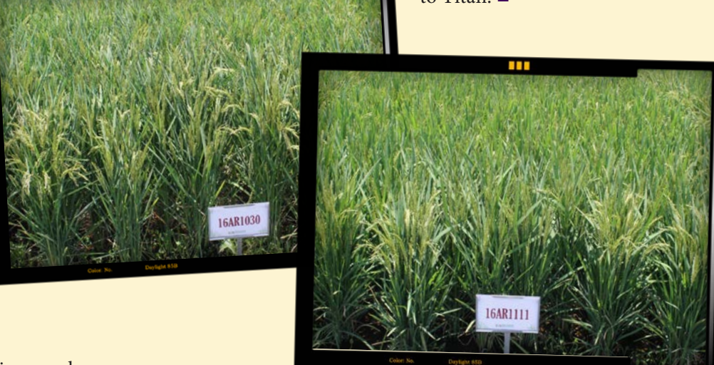
(Pictured L-R) CLM04 (16AR1030) and CLL15 (16AR1111) are two new and exciting Clearfield® rice varieties.

quality, low chalkiness plump kernel size similar to Titan. ■