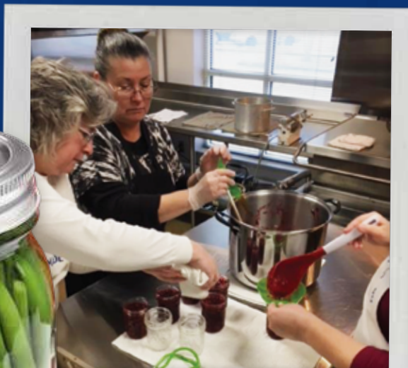
Canning class participants work to properly fill their jars full of festive cranberry orange chutney.