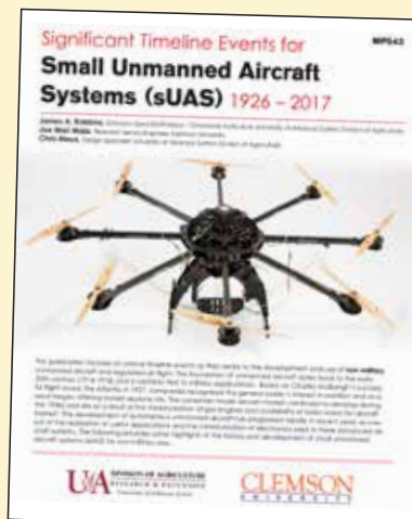
2018 Significant Timeline Events for Small Unmanned Aircraft Systems (sUAS) 1926-2017 cover

The award serves to give those authors of extension publications recognition among their peers and administrators. ■