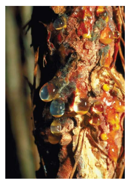
Figure 5. Pycnia of fusiform rust.

urediniospores which reinfect the oak upon which they developed. The reinfected sites develop hairlike or whiplike structures called telia (Figure 8). Telia produce teliospores which germinate and produce four basidiospores each. The basidiospores are released at night and are carried by wind to the succulent young needles and cones of susceptible pines. The fungal infection eventually spreads from the needles and cones into the branches or stem of