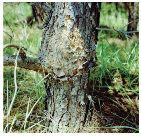
Figure 3. This fusiform-infected stem will survive the infection but is more susceptible to breakage.