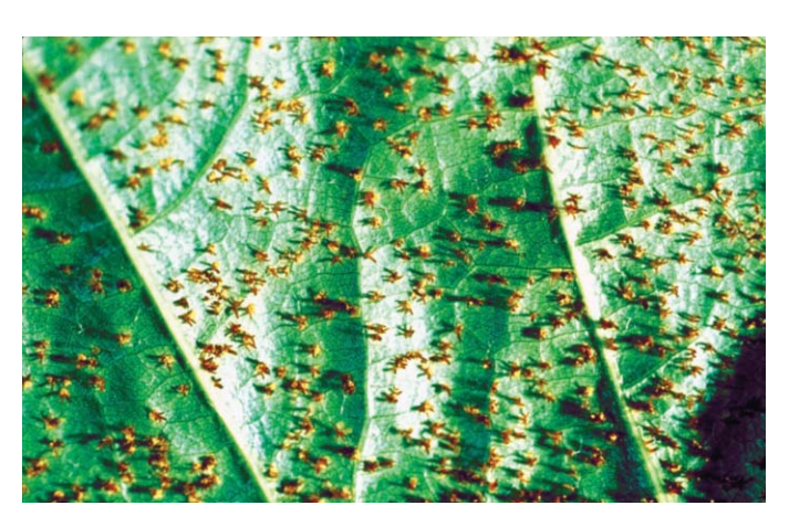
Figure 8. Telia on the underside of an oak leaf.