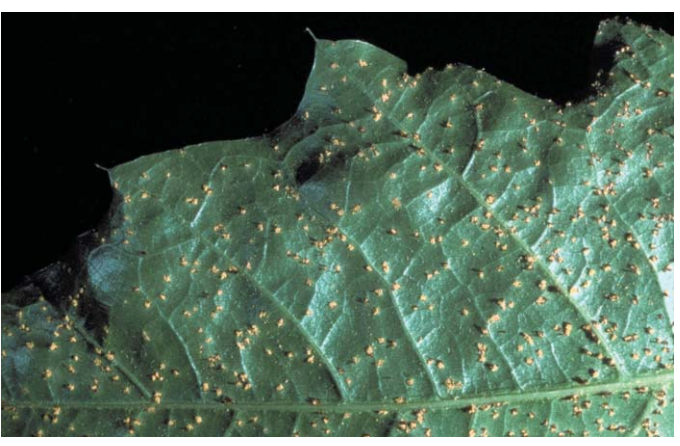
Figure 7. Uredinia on the underside of an oak leaf.