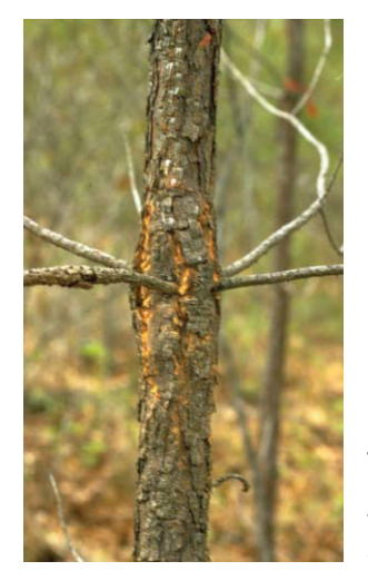
Figure 2. Fusiform rust has girdled this young pine stem. It will not survive.

than five years old (Figure 2). Older trees can survive infection indefinitely but will be structurally weakened (Figure 3). The structural damage reduces the quality and value of the stem and increases the chances that the stem will break during wind or ice storms.