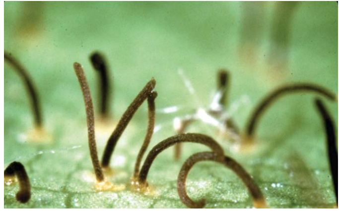
Figure 10. Close-up of telia on an oak leaf.